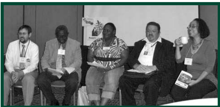
Model Leadership Panel

Speakers came from around the country and the state to share